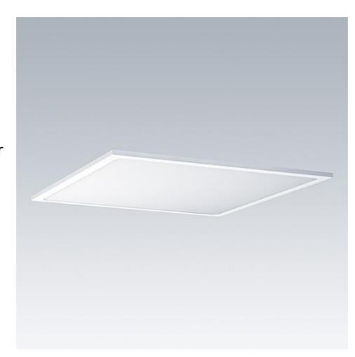
Photographs, line drawings and photometric data are representative only. For specific product detail please select an individual product.