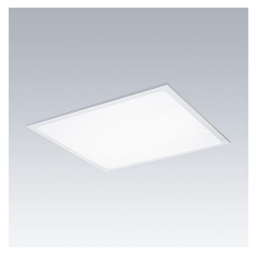
Photographs, line drawings and photometric data are representative only. For specific product detail please select an individual product.