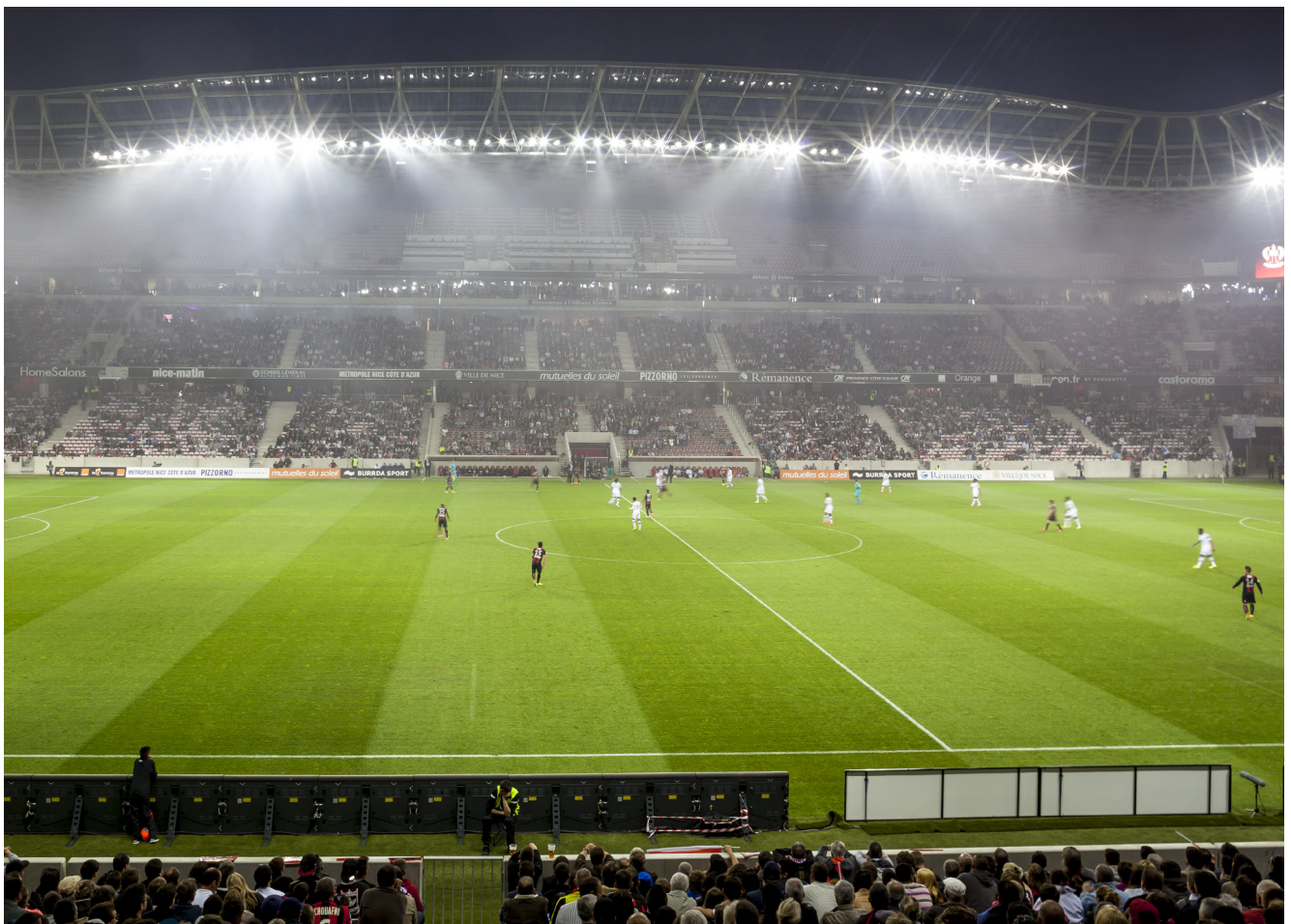
Allianz Riviera, Nice - OGC Nice - www.ogcnice.com – Photo: Serge Demailly