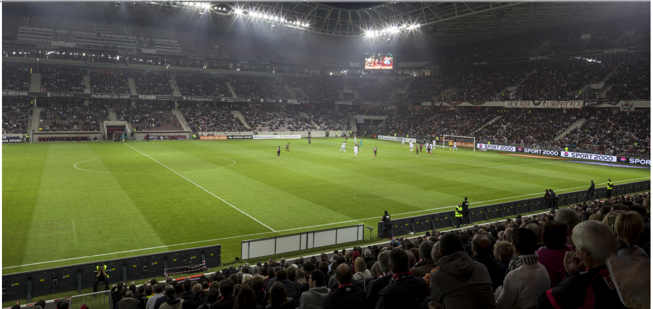
Allianz Riviera, Nice - OGC Nice - www.ogcnice.com

VINCI, a returning customer and leading player in building and operating the hosting Euro 2016 stadia, approached Thorn with a requirement to provide Allianz Riviera's pitch and exterior sports and area lighting.