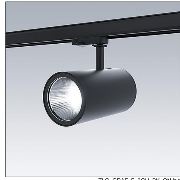
TLG GRAF F 3GU BK ON.jpg