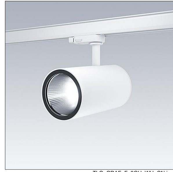
TLG GRAF F 3GU WH ON.jpg