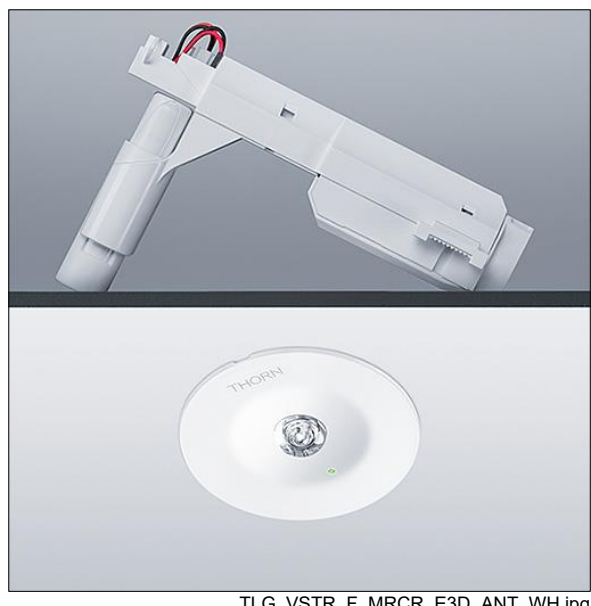
TLG VSTR F MRCR E3D ANT WH.jpg

All values marked with an * are rated values. Thorn uses tried and tested components from leading suppliers, however there may be isolated instances of technology-related failures of individual LEDs during the rated product lifetime. International standards set the tolerance in initial flux and connected load at ±10%. Unless stated otherwise, the values apply to an ambient temperature of 25°C.