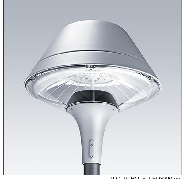
TLG PLRO F LEDSYM.jpg