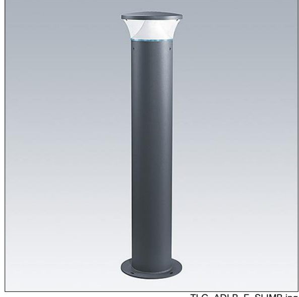
TLG ADLB F SLIMB.jpg