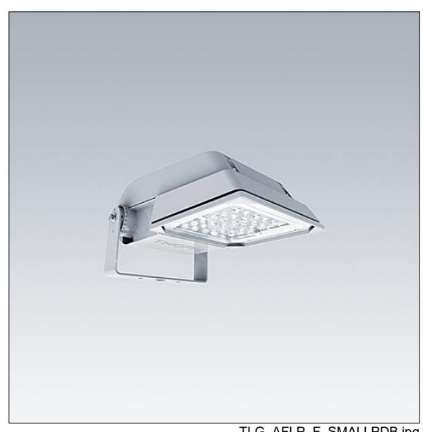
TLG AFLP F SMALLPDB.jpg