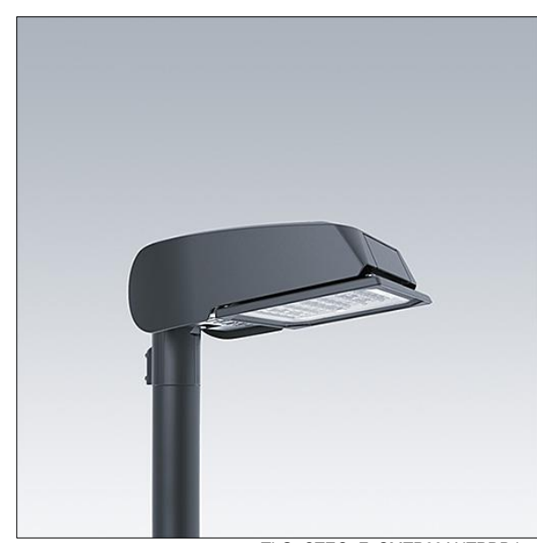
TLG CTEQ F SMTP60ANTPDB.jpg