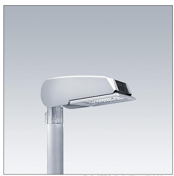
TLG CTEQ F SMTP36LEDPDB.jpg