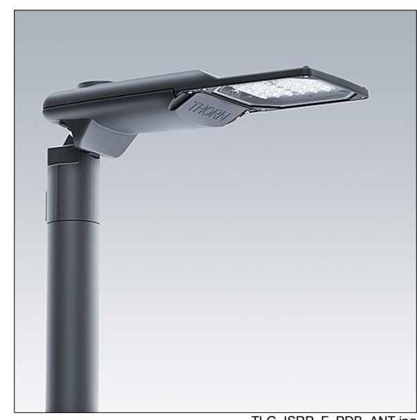
TLG ISRP F PDB ANT.jpg