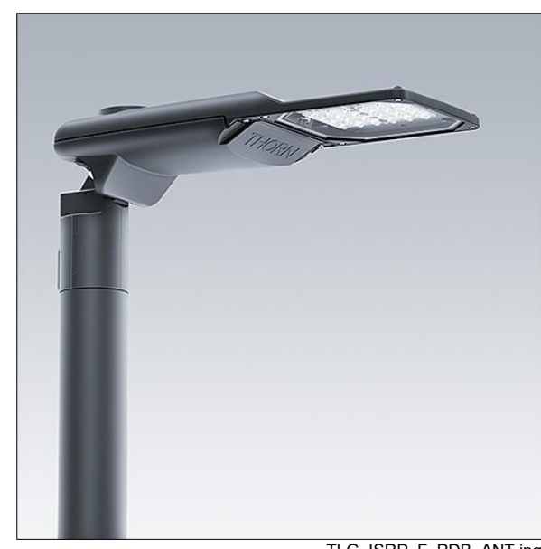
TLG ISRP F PDB ANT.jpg