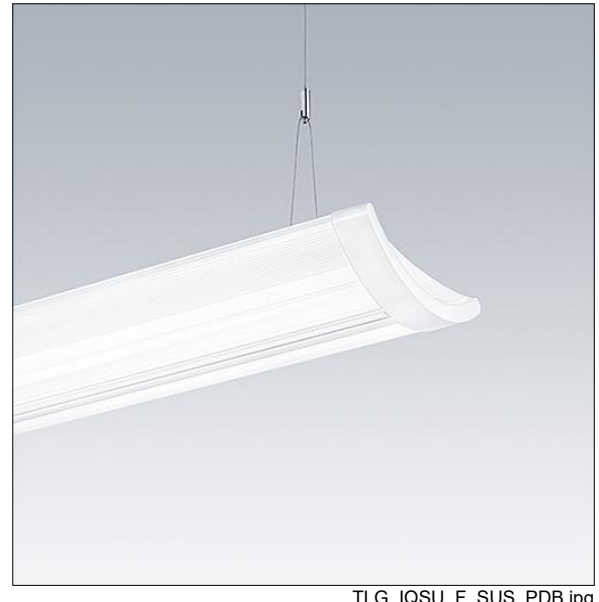
TLG IQSU F SUS PDB.jpg