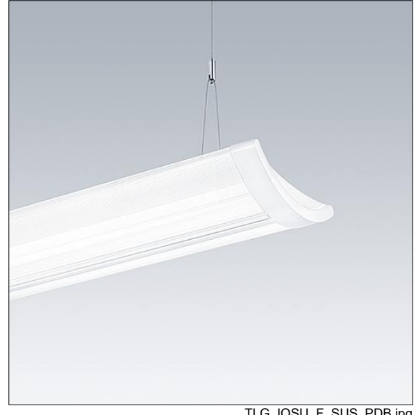
TLG IQSU F SUS PDB.jpg