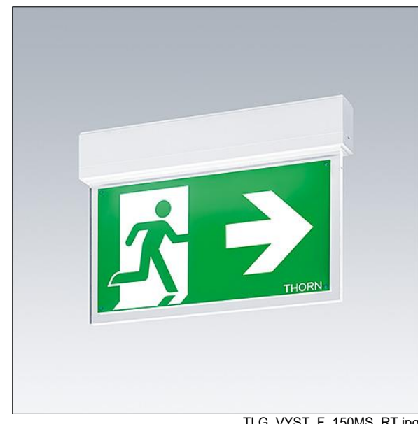
TLG VYST F 150MS RT.jpg