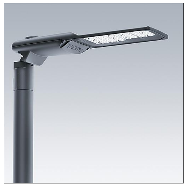
TLG ISRP F M PDB ANT.jpg