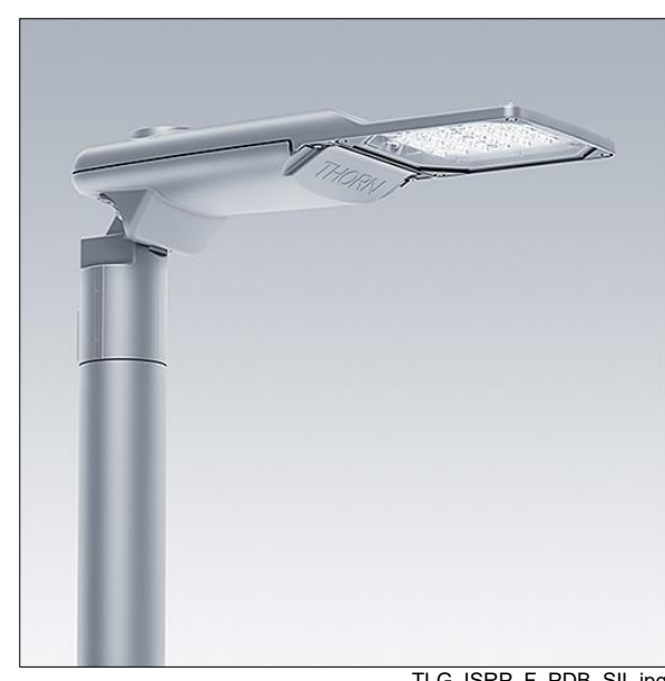
TLG ISRP F PDB SIL.jpg