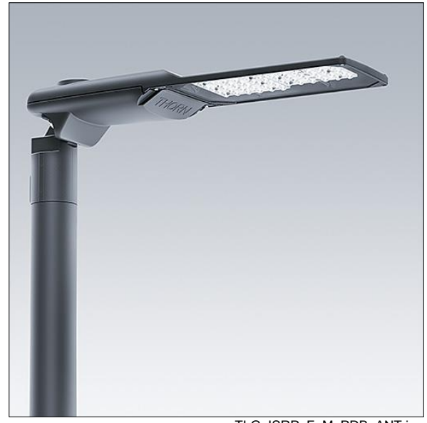
TLG ISRP F M PDB ANT.jpg