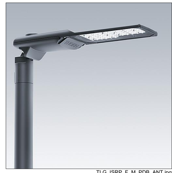
TLG ISRP F M PDB ANT.jpg