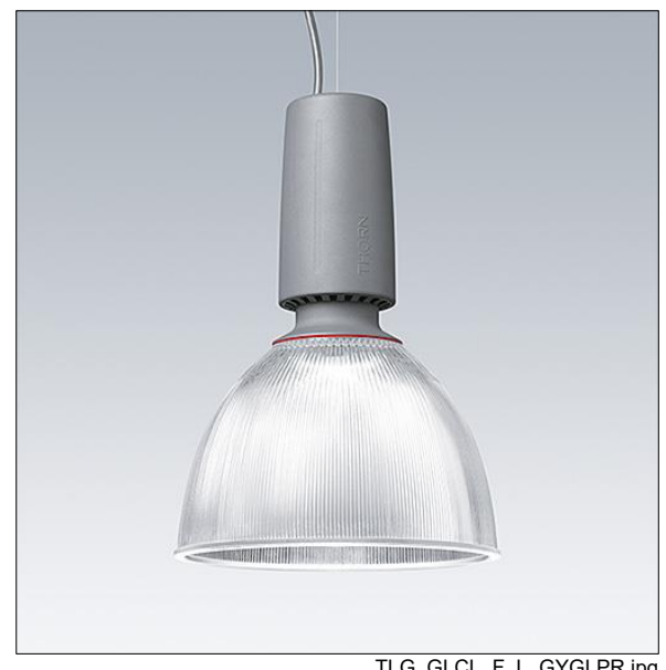
TLG GLCL F L GYGLPR.jpg