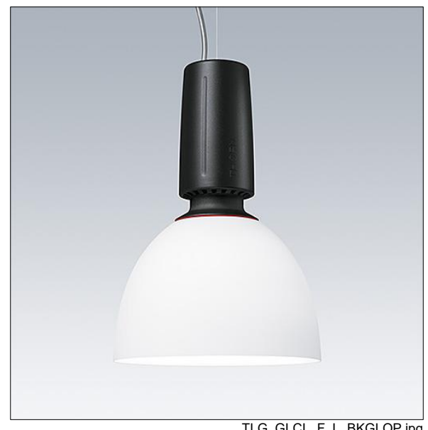
TLG GLCL F L BKGLOP.jpg