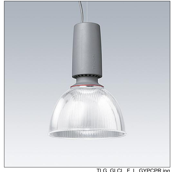
TLG GLCL F L GYPCPR.jpg