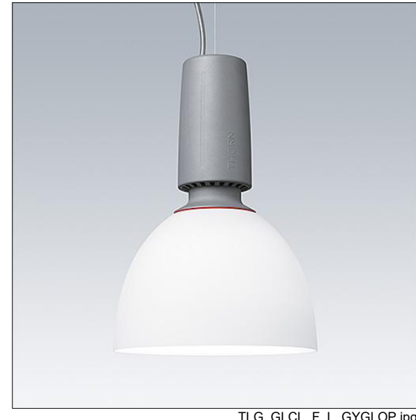
TLG GLCL F L GYGLOP.jpg