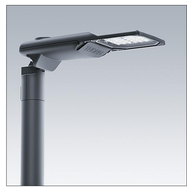
TLG ISRP F PDB ANT.jpg