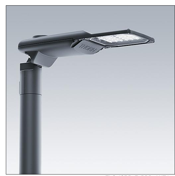
TLG ISRP F PDB ANT.jpg