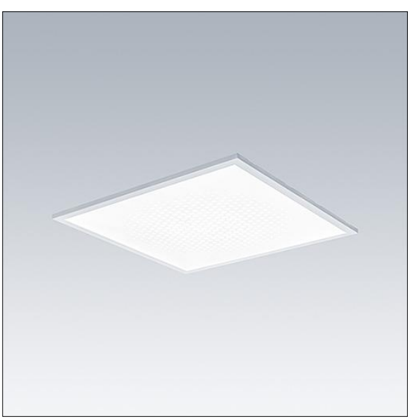
TLG OMP2 F QH PDB.jpg

Dimensions: 597 x 597 x 55 mm Luminaire input power: 27.4 W Luminaire luminous flux: 3800 lm Luminaire efficacy: 139 lm/W Weight: 5.05 kg