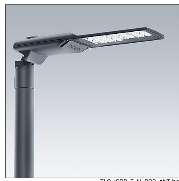
TLG ISRP F M PDB ANT.jpg