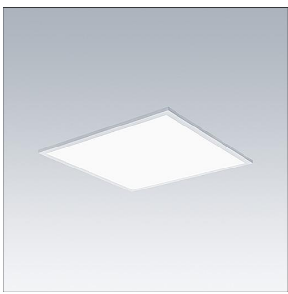
TLG OMP2 F QO PDB.jpg

Dimensions: 597 x 597 x 55 mm Luminaire input power: 23.7 W Luminaire luminous flux: 2650 lm Luminaire efficacy: 112 lm/W Weight: 5.05 kg