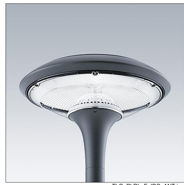
TLG PLRL F IDC ANT.jpg