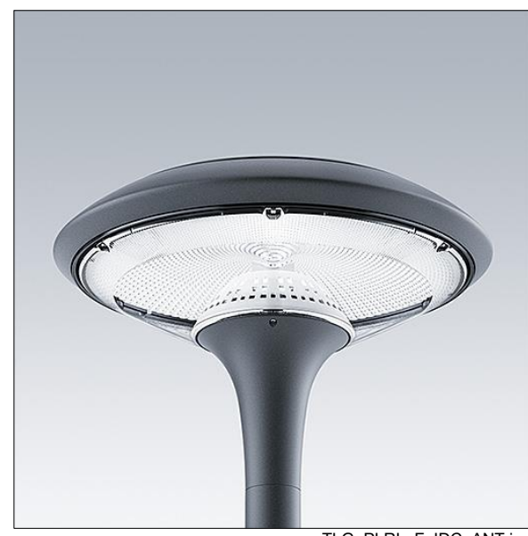
TLG PLRL F IDC ANT.jpg