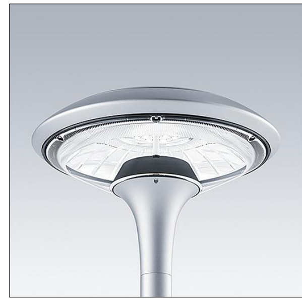
TLG PLRL F DDC GY.jpg