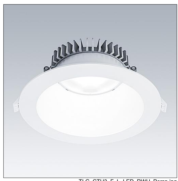
TLG CTU3 F L LED RWH Persp.jpg