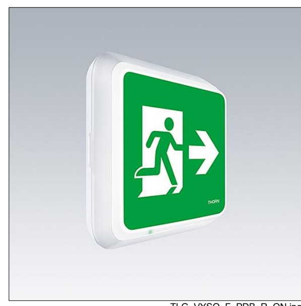
TLG VYSQ F PDB R ON.jpg

A slim, square, surface mounted, LED safety sign luminaire. Luminaire for central emergency light supply, for single monitoring of the luminaire via Powerline in connection with the eBox System, settable emergency light level. NFC interface for addressing, configuration and maintenance via PROset Pen (article: 22170290) or PROset app, addressing also alternatively possible visually or via EZ-addressing. Power supply: 220-240 Vac (± 10%), 50/60 Hz; 176-280 Vdc. Body: injection moulded polycarbonate, white (RAL 9016). Diffuser: opal polycarbonate, with glued, printed emergency exit direction arrow (right) pictogram according to ISO 7010. Uniform backlighting of pictogram, luminance > 500 cd/m<sup>2</sup> in the white region and 200 cd / m<sup>2</sup> on average in mains mode (according to DIN 4844), 2 cd / m² minimum in emergency mode (according to EN 1838). Recognition distance according to EN 1838: 44m. Class II electrical, IP65, Impact strength: IK10. ambient temperature: -30°C to +35°C. Suitable for direct mounting to wall. Loop-in, loop-out is possible for cables up to 2.5 mm<sup>2</sup>. BESA compatible. Food certificate (to be used in areas with fully packaged food). Luminaire wired with halogen free and silicone free leads. Luminaire with D symbol (for use in environments in which the accumulation of conductive dust on the luminaire can be expected).