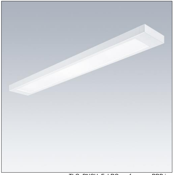
TLG PNCH F LRO surface on PDB.jpg