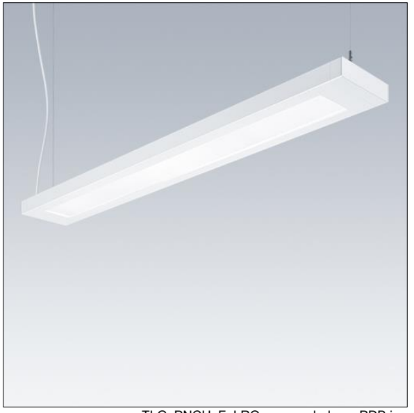
TLG PNCH F LRO suspended on PDB.jpg