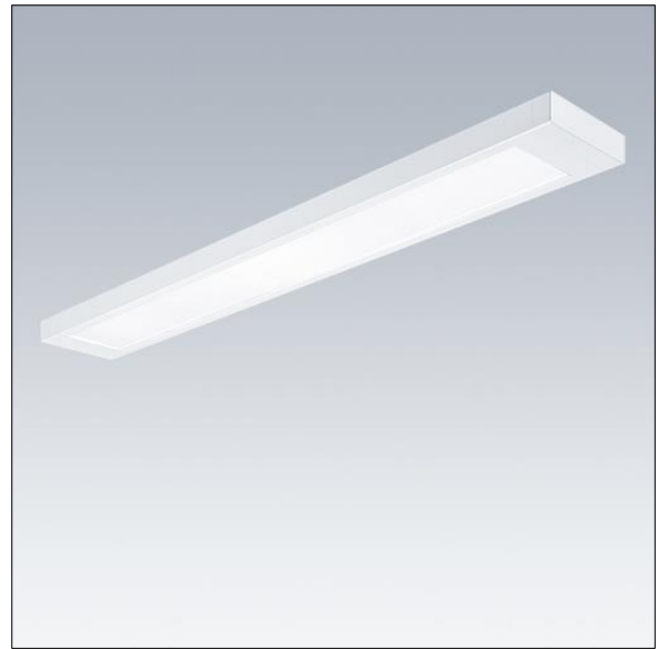
TLG PNCH F LRO surface on PDB.jpg