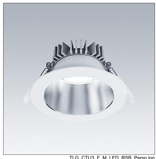
TLG CTU3 F M LED RSB Persp.jpg