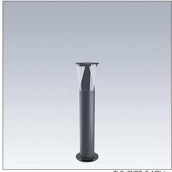
TLG CNDB F MPL.jpg