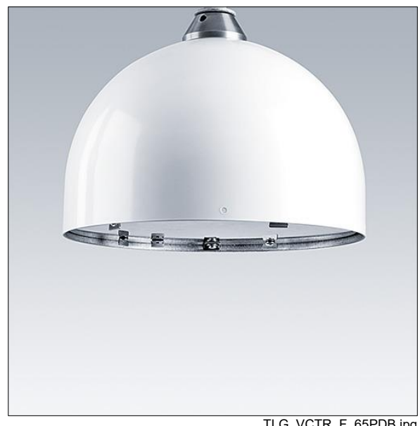
TLG VCTR F 65PDB.jpg

Weight: 4.75 kg Scx: 0.084 m<sup>2</sup>