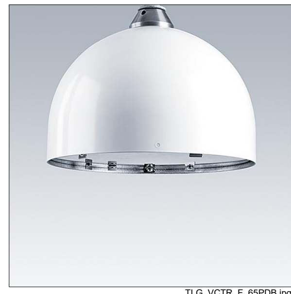
TLG VCTR F 65PDB.jpg

Weight: 4.84 kg Scx: 0.084 m<sup>2</sup>