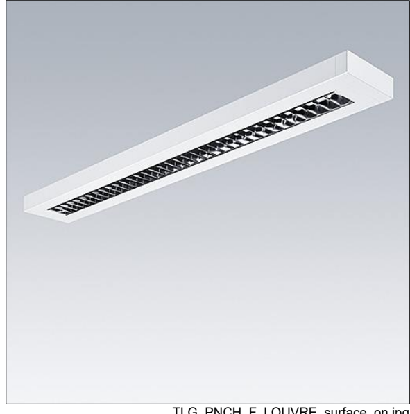
TLG PNCH F LOUVRE surface on jpg