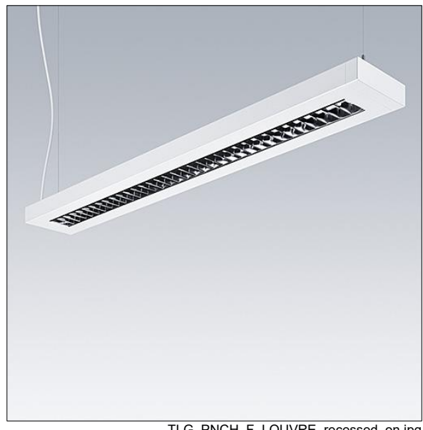
TLG PNCH F LOUVRE recessed on jpg