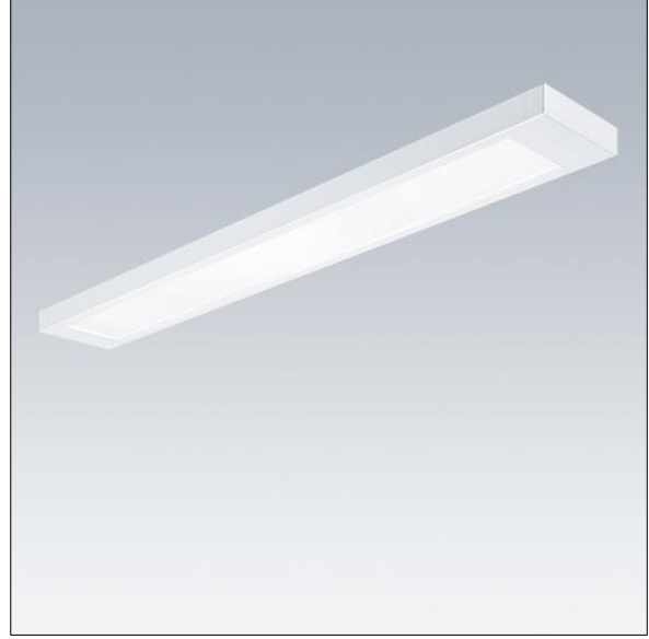
TLG PNCH F LRO surface on PDB.jpg