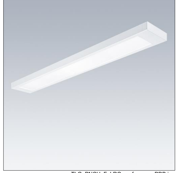
TLG PNCH F LRO surface on PDB.jpg