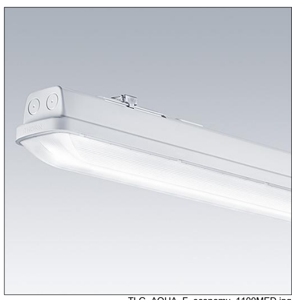
TLG AQUA F economy 1100MED.jpg

This product contains a light source of energy efficiency class D.