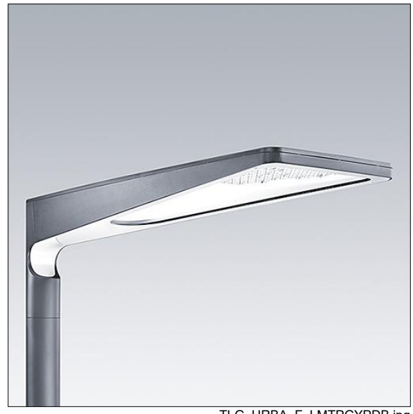
TLG URBA F LMTPGYPDB.jpg