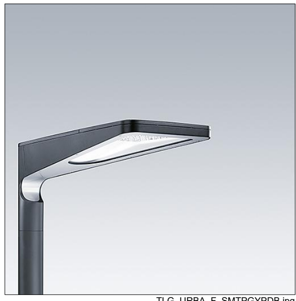
TLG URBA F SMTPGYPDB.jpg