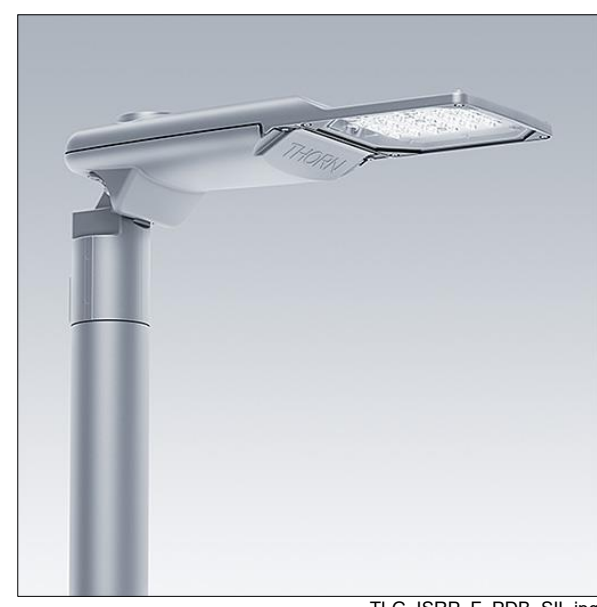
TLG ISRP F PDB SIL.jpg

Weight: 5.12 kg Scx: 0.054 m<sup>2</sup>