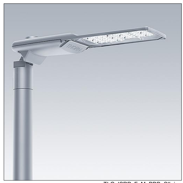
TLG ISRP F M PDB SIL.jpg